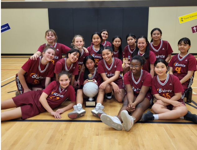
Gr. 7 Girls place first in the Holy Trinity Basketball Tournament