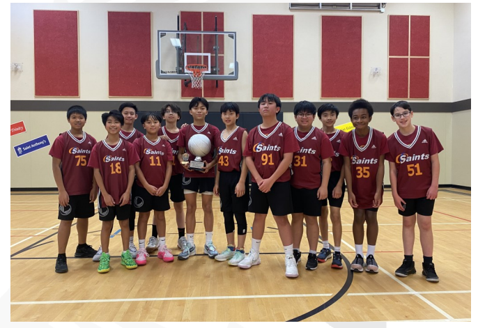
Gr. 7 boys win the Holy Trinity Basketball Tournament.