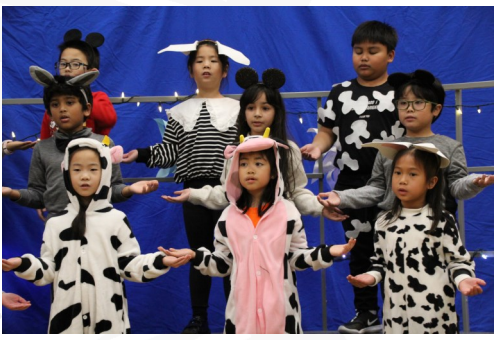
Grade 2 What Shall We Bring?