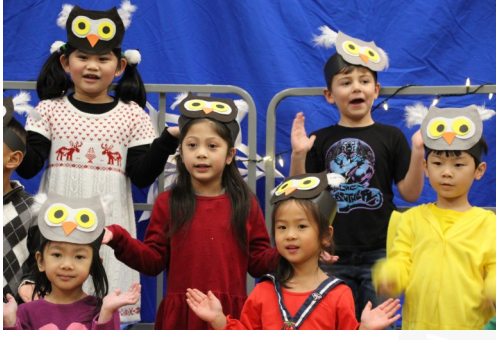
Kindergarten: Hoo, Hoo. Hoo, Can it Be?