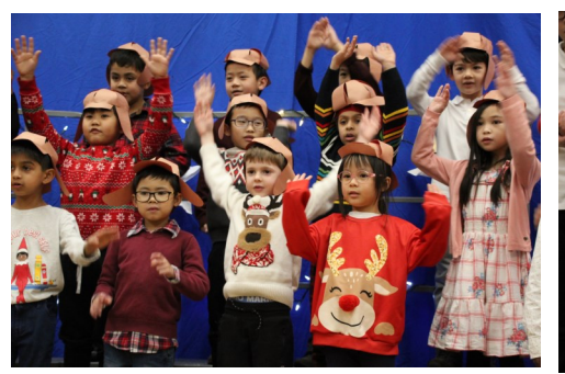
Grade 1 A Musical Manger Mystery